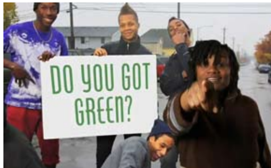
Got Green video 2010© available on YouTube.